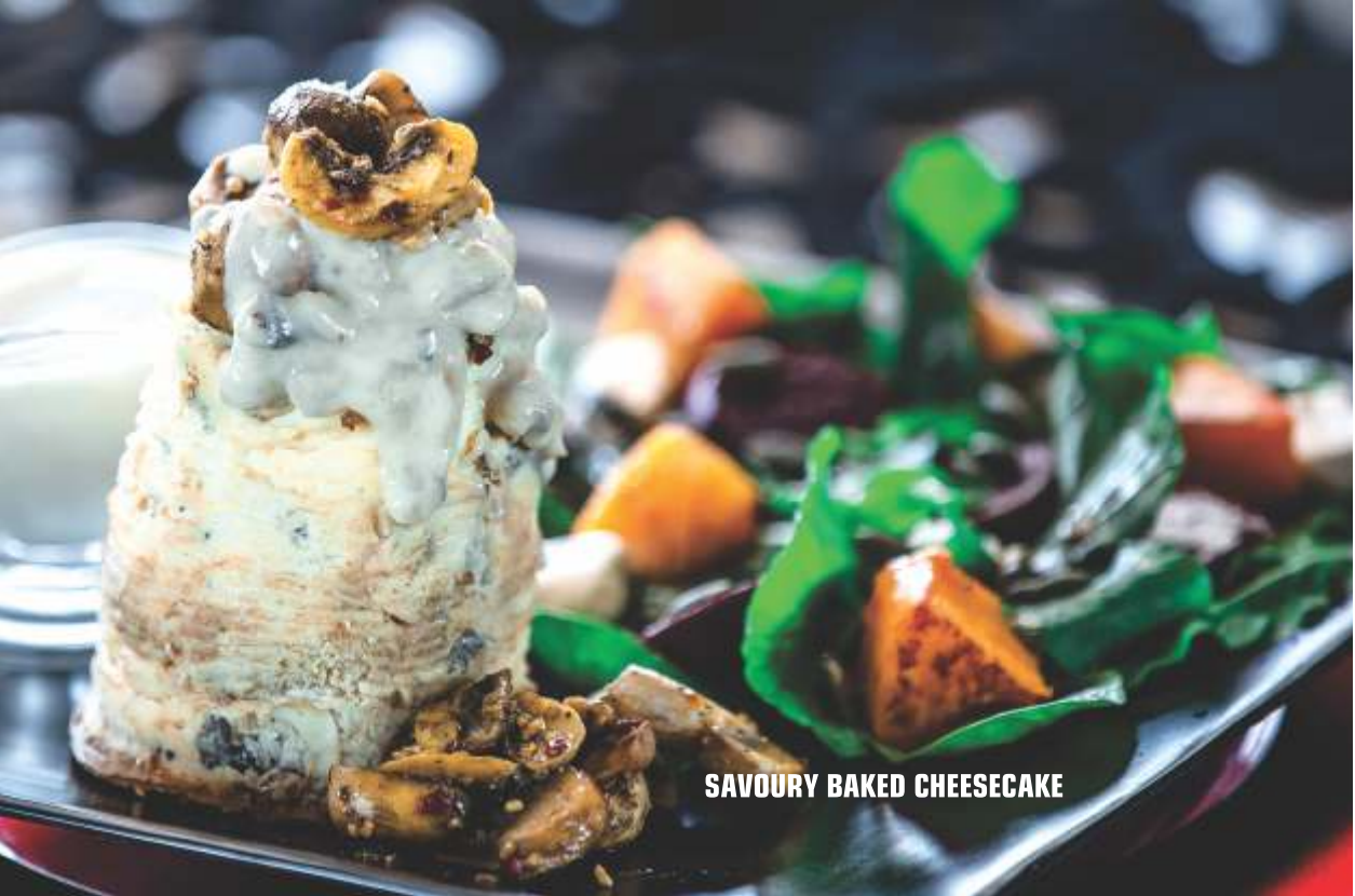
SAVOURY BAKED CHEESECAKE