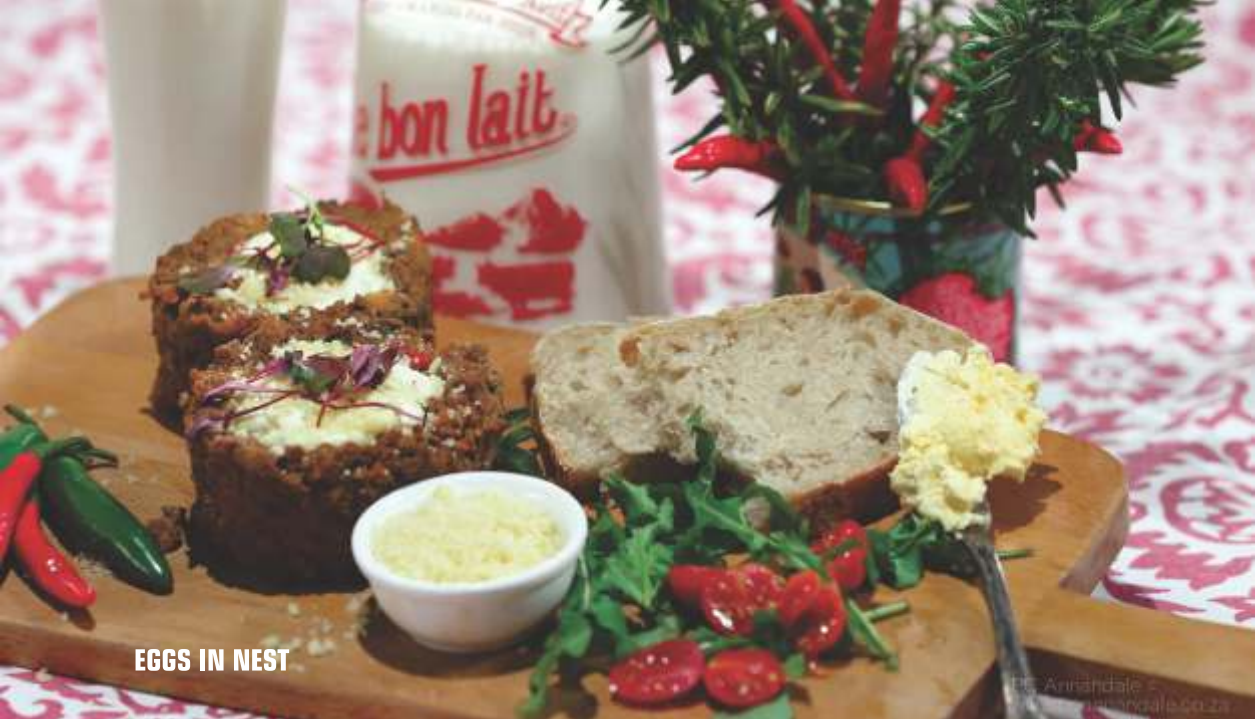
EGGS IN NEST