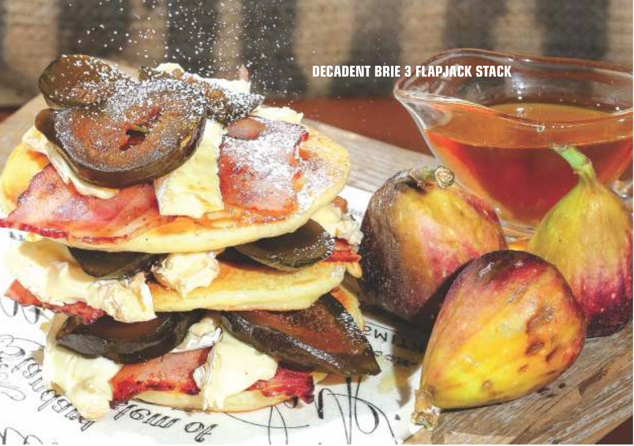
DECADENT BRIE 3 FLAPJACK STACK